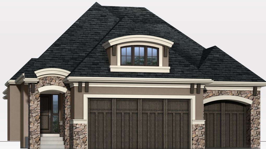
FRENCH COUNTRY ELEVATION