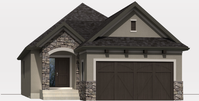
FRENCH COUNTRY ELEVATION